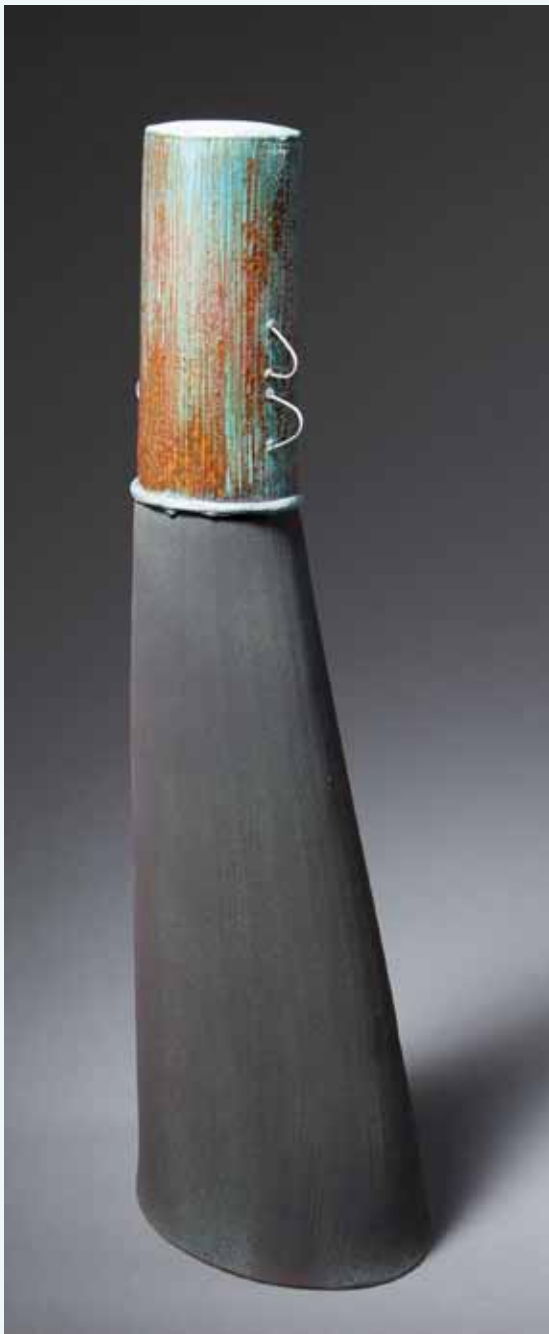
Exhibit: Jan. 15 - Feb. 9, 2013 The 1912 Gallery, Emory & Henry College

Statement: The ordinary is quite extraordinary. Through objects of insistent profile and reductive form, my reference is to architectural, mechanical and industrial elements. The representation of function is in an allusive and enigmatic sense, suggestive of the past. Close consideration of these images of simplicity and stillness reveals a sense of history, traces of transformation that generate narratives of accretion and deterioration.